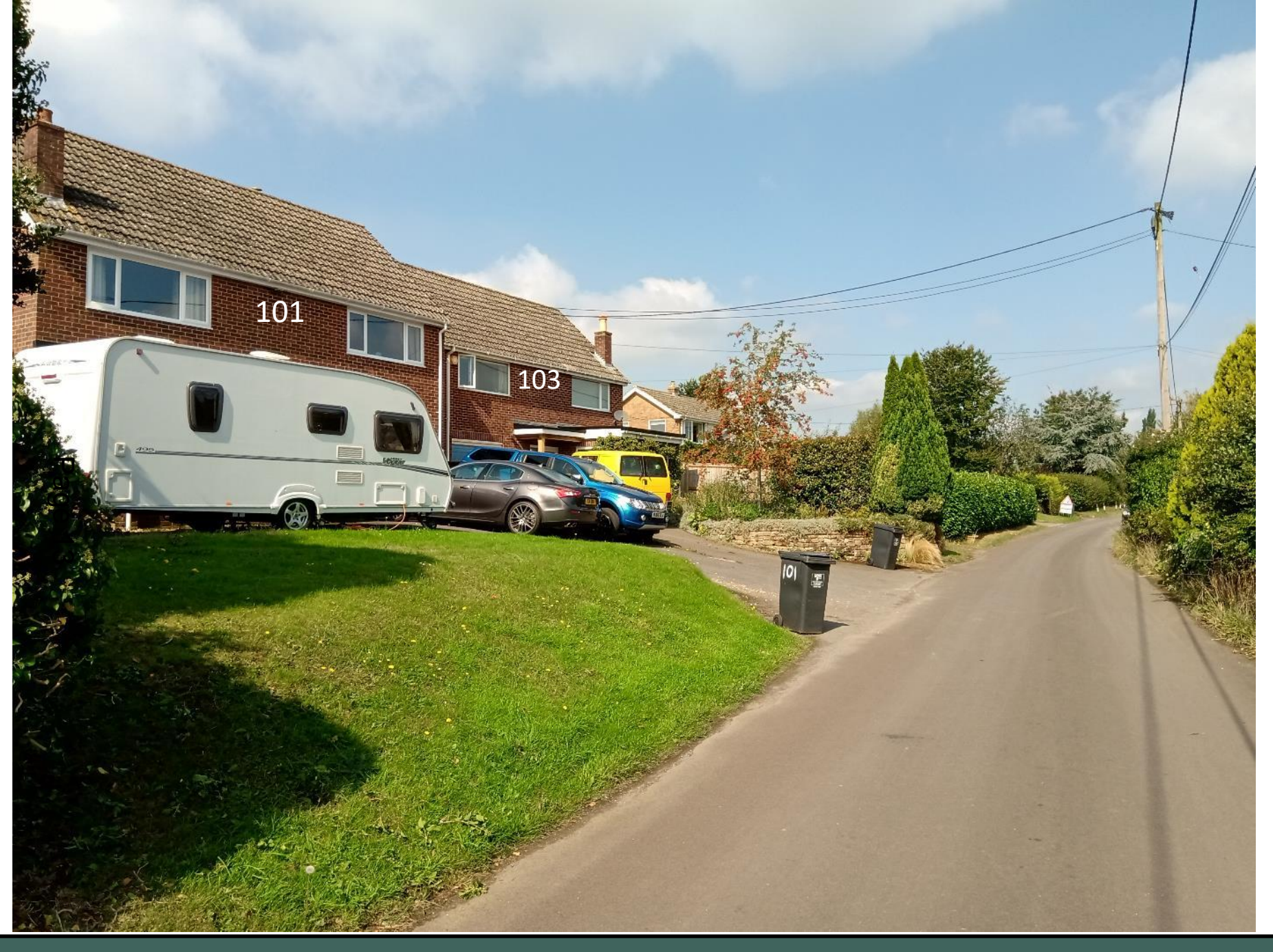
OPPOSITE PAIR OF PROPERTIES – 101 & 103