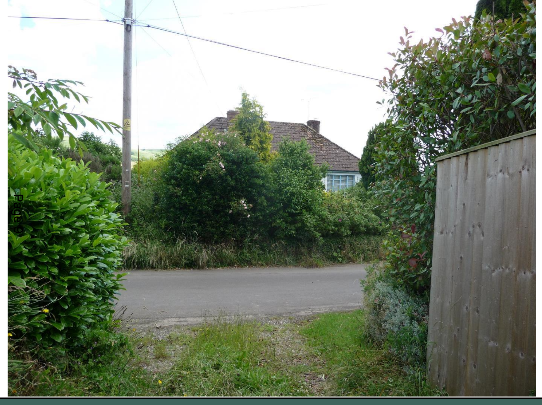
BUNGALOW VIEWED FROM THE OPPOSITE SIDE OF THE STREET